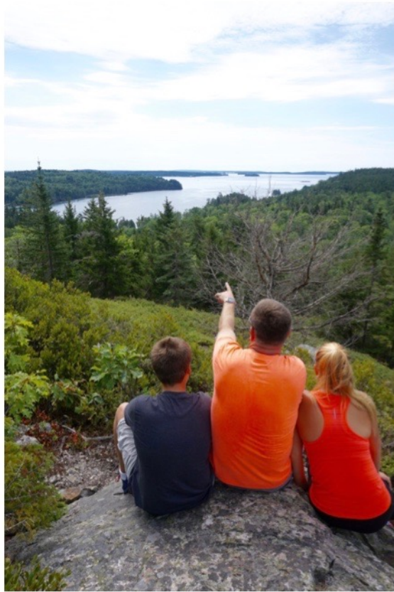
Looking toward the future from John B Mountain